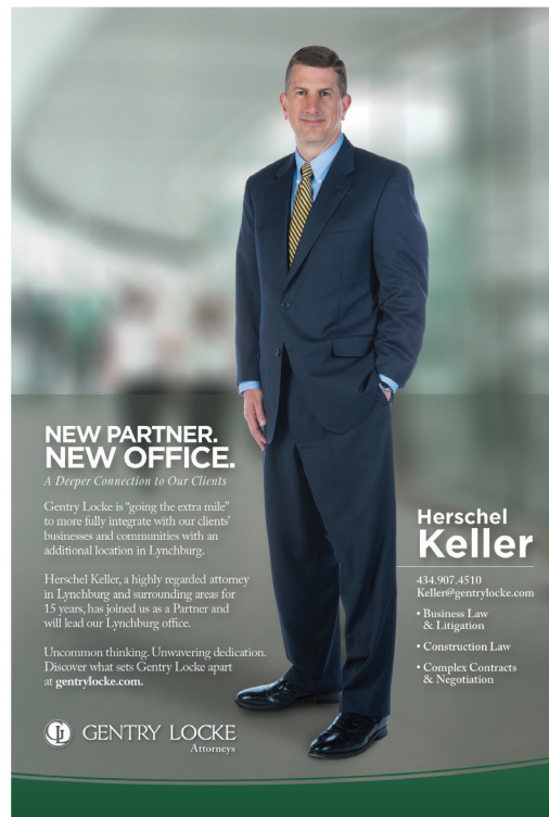
GENTRY LOCKE ADS