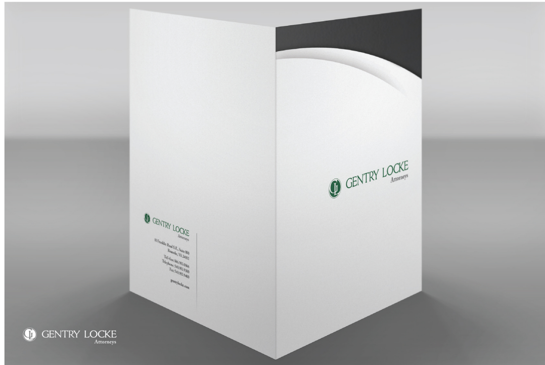
GENTRY LOCKE STATIONERY PACKAGE

📍 31 West 34th Street Suite 8128, New York City, NY 10001